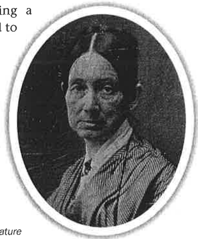
▲ Dorothea Dix (ca. 1846)

IMPROVING EDUCATION Before the mid-1800s, no uniform educational policy existed in the United States. School conditions varied across regions. Massachusetts and Vermont were the only states before the Civil War to pass a compulsory school