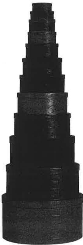
▲ These fine oval wooden boxes were made in the Shaker village in Canterbury, New Hampshire. They were used for storing small items.

The failure of the utopian communities did not lessen the zeal of the religious reformers. Many became active in humanitarian reform movements, such as the abolition of slavery and improved conditions for women.