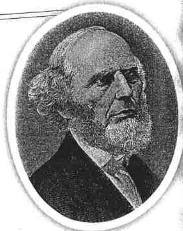
▲ Charles Grandison Finney

When Charles Grandison Finney preached, his listeners shrieked, moaned, and fainted. The most famous preacher of the era, Finney inspired emotional religious faith, using a speaking style that was as much high drama as prayer or sermon. Converted at the age of 29, Finney traveled by horseback to deliver his message. Finney seated the most likely converts in his audiences on a special “anxious bench,” where he could fasten his eyes upon them. He lectured on the depth of the conversion experience.