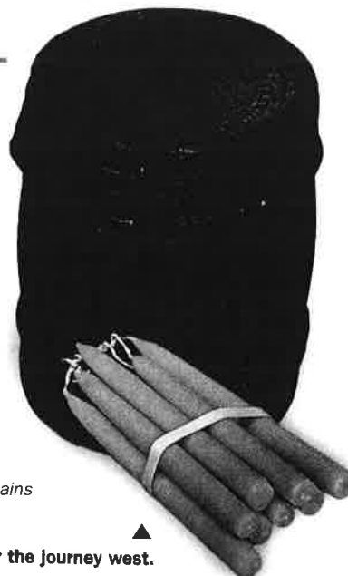
Supplies for the journey west.

—from Travels to the West of the Allegheny Mountains