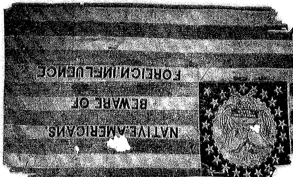
The 1854 campaign banner for the Know-Nothing Party reflects its members' fear and resentment of immigrants.

In 1854 the Kansas-Nebraska Act brought about the demise of the Whigs, who once again took opposing positions on legislation that involved the issue of slavery. Unable to agree on a national platform, the Southern faction splintered as its members looked for a proslavery, pro-Union party to join, while Whigs in the North sought a political alternative.