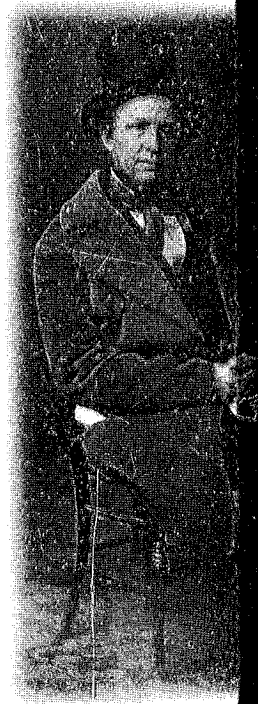
▲ Horace Greeley founded the New York Tribune in 1841.

Greeley's appeal accurately reflected the changing national political scene. With the continuing tension over slavery, many Americans needed a national political voice. That voice was to be the Republican Party.