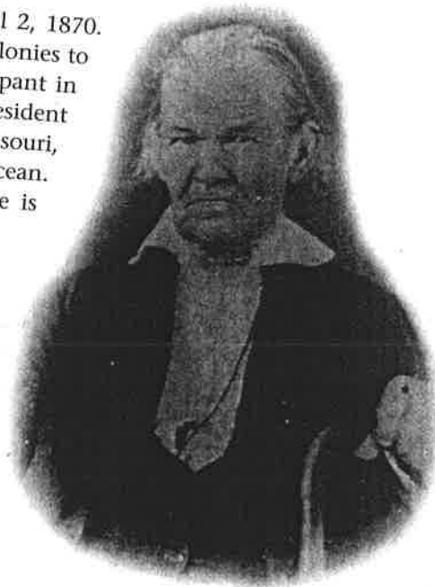
▲ Patrick Gass

By charting unexplored territory, the Lewis and Clark expedition helped lay the foundations for western expansion. It was one of the great achievements of the Jefferson presidency.