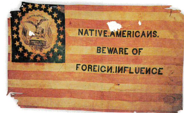
▲ The 1854 campaign banner for the Know-Nothing Party reflects its members' fear and resentment of immigrants.

THE FREE-SOILERS Many Northerners were Free-Soilers without being abolitionists. A number of Northern Free-Soilers supported laws prohibiting black settlement in their communities and denying blacks the right to vote. Free-Soilers objected to slavery's impact on free white workers in the wage-based labor force, upon which the North depended. Abolitionist William Lloyd Garrison considered the Free-Soil Party "a sign of discontent with things political . . . reaching for something better. . . . It is a party for keeping Free Soil and not for setting men free."