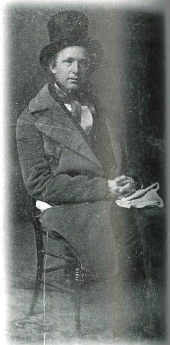
▲ Horace Greeley founded the New York Tribune in 1841.

Greeley's appeal accurately reflected the changing national political scene. With the continuing tension over slavery, many Americans needed a national political voice. That voice was to be the Republican Party.