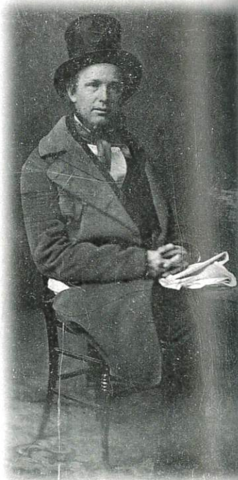
▲ Horace Greeley founded the New York Tribune in 1841.

SLAVERY DIVIDES WHIGS Divisions in the Whig Party widened in 1852 when General Winfield Scott became the Whig nominee for president. Scott owed his