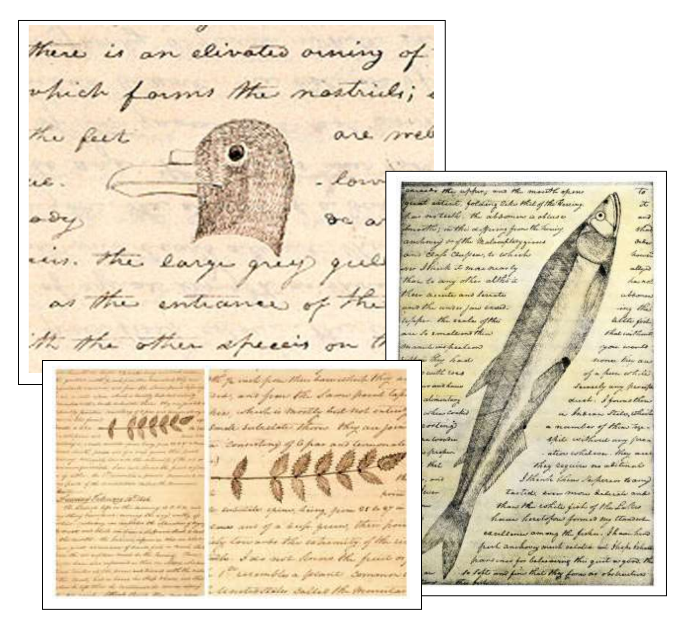
Excerpts from Lewis's journals. c. 1804